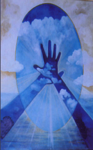
Background to the Revivals